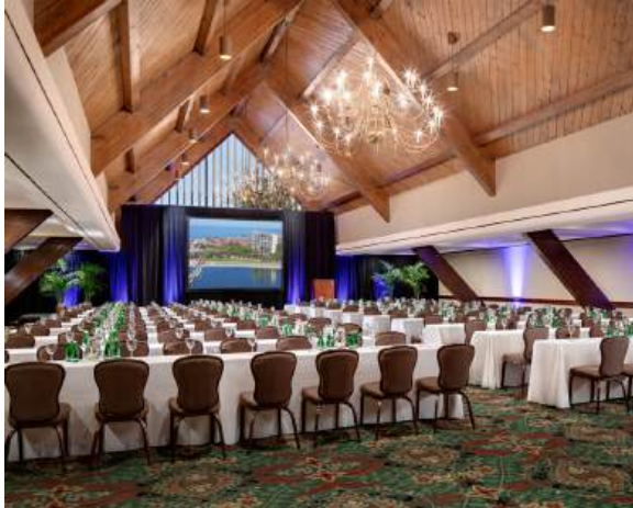
KON TIKI BALLROOM